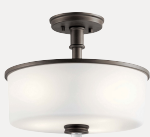
Ceiling Lighting 43926OZ

To see the complete Joelson™ Collection visit Kichler.com.